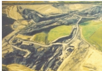
Rye Hill opencast coal mine