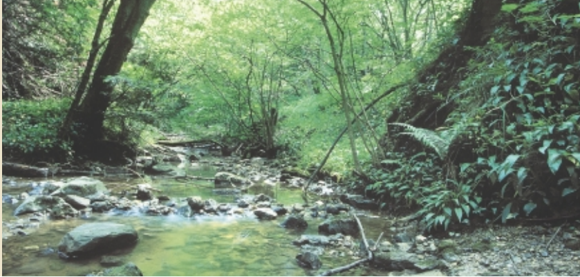
The Cong Burn

Edmondsley Wood is a mixed deciduous woodland situated on an ancient woodland site. This woodland is part of the mosaic habitat that links the Wear Valley to the mid altitude areas of Stanley and Consett.