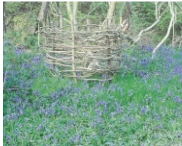
Coppiced hazel with deer guards

Sweet Cicely the Liquorice plant tastes and smells of aniseed. The oily seed cases are sometimes used by woodturners to polish finished carved pieces, similar to the Westmoreland practice of using leaves to polish oak panels.